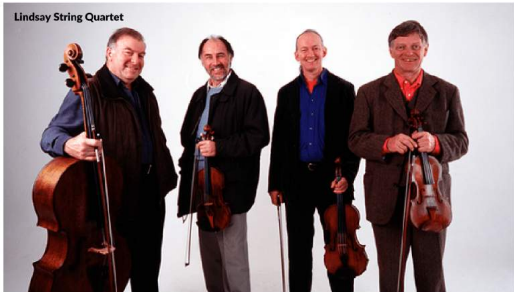
Lindsay String Quartet