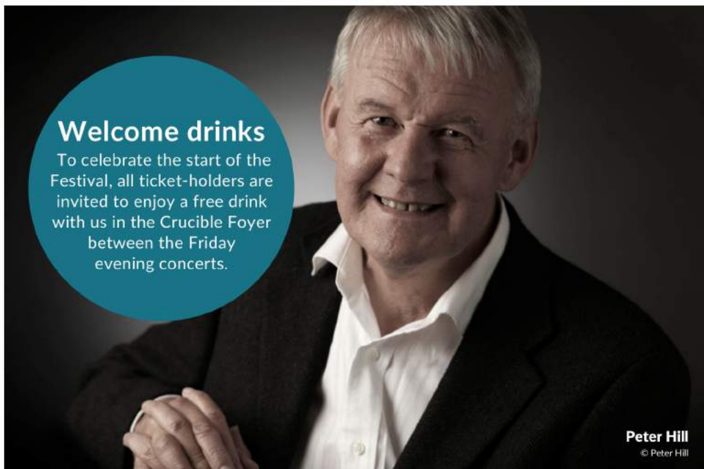
Peter Hill © Peter Hill

To celebrate the start of the Festival, all ticket-holders are invited to enjoy a free drink with us in the Crucible Foyer between the Friday evening concerts.