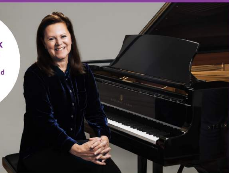
Kathryn Stott

*Terms and conditions apply, see back pages for details