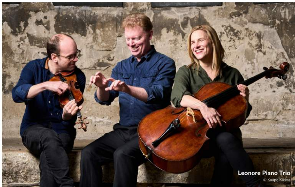
Leonore Piano Trio