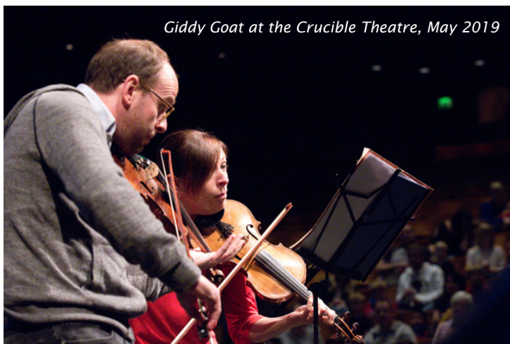
Giddy Goat at the Crucible Theatre, May 2019