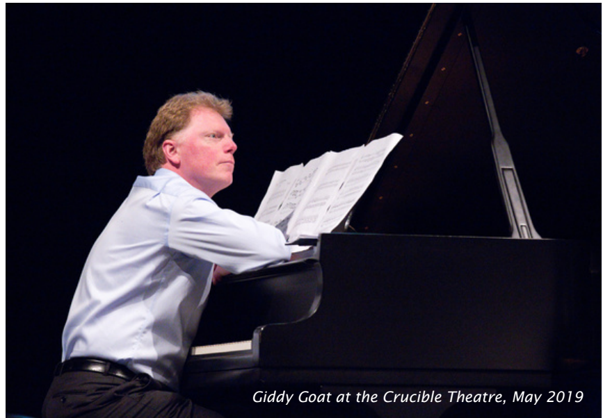
Giddy Goat at the Crucible Theatre, May 2019

In the second week of term, a TRAINING SESSION FOR TEACHERS & PRACTITIONERS will focus on supporting you to get the most out of classroom singing, building your confidence to lead warm-up activities and create singing games suited to developing young voices and early musicianship skills.