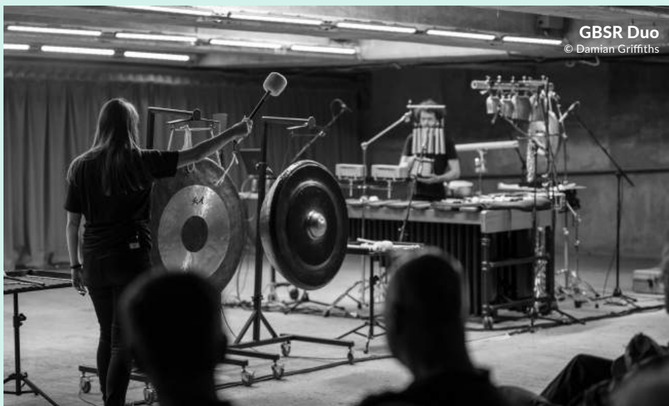
GBSR Duo