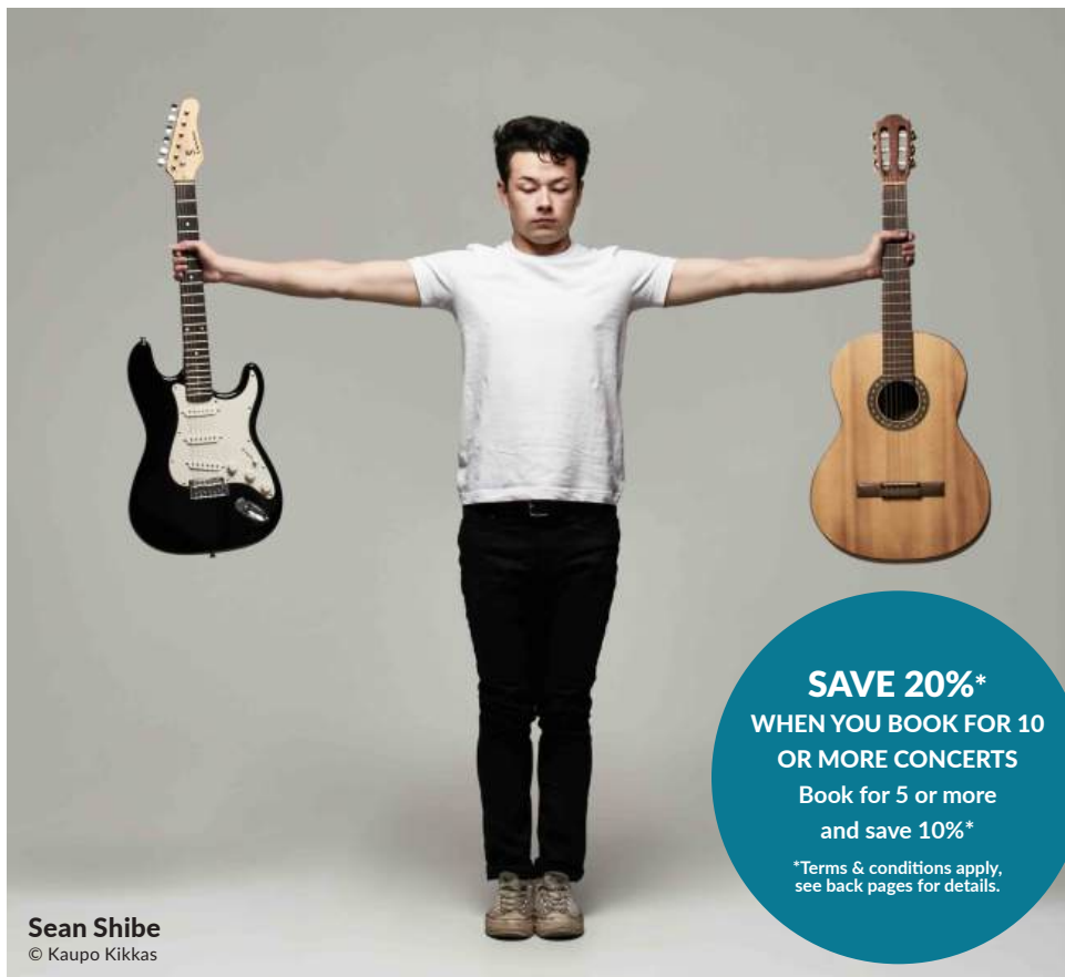
Sean Shibe

SAVE 20%* WHEN YOU BOOK FOR 10 OR MORE CONCERTS