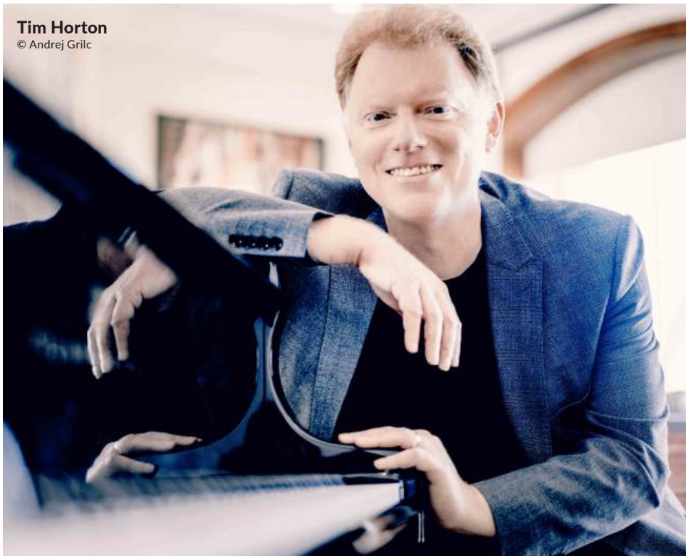
Tim Horton