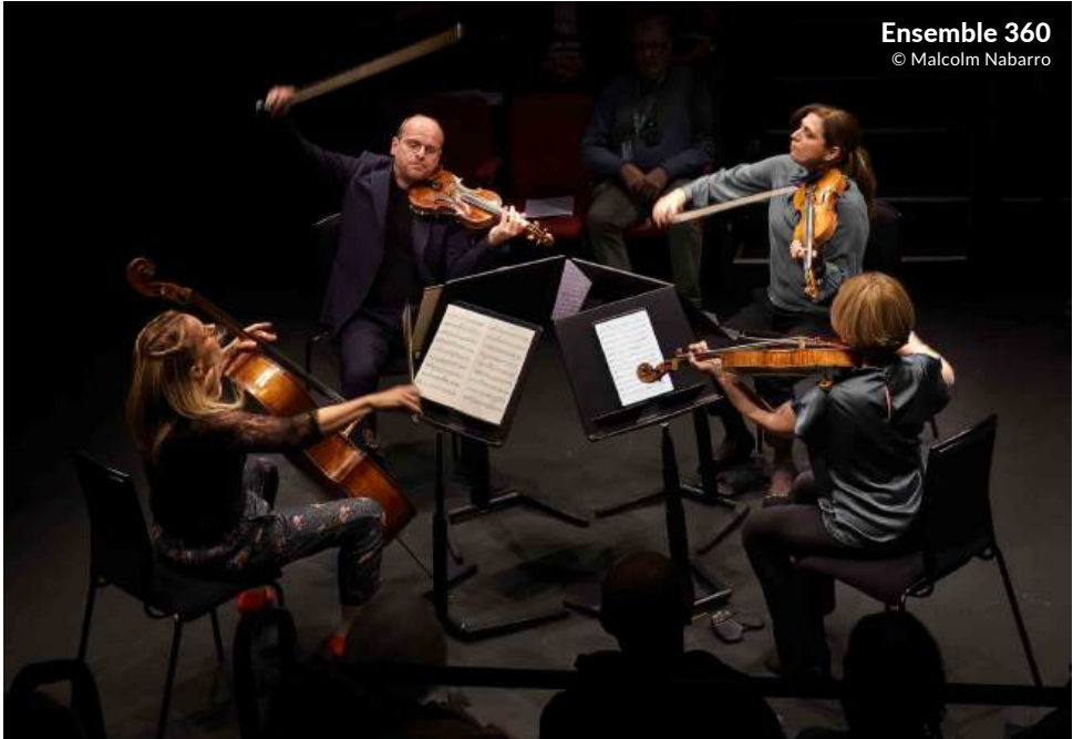
Ensemble 360