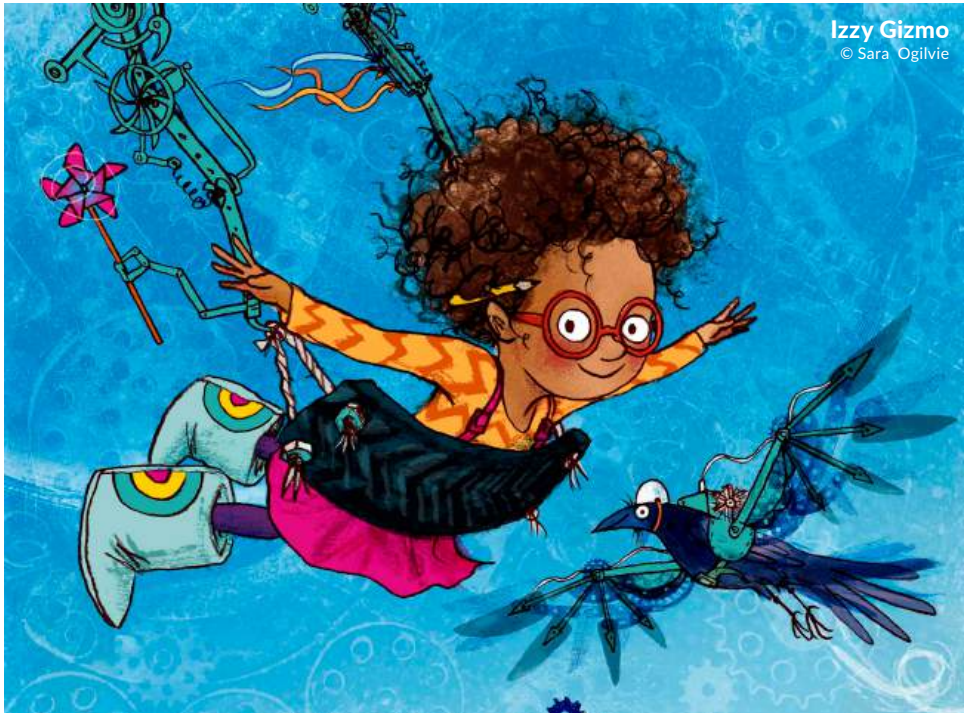
Izzy Gizmo © Sara Ogilvie