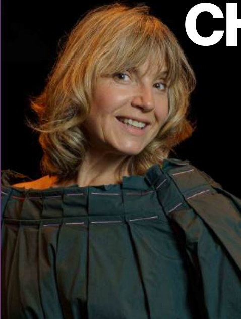
Claire Booth © Malcolm Nabarro