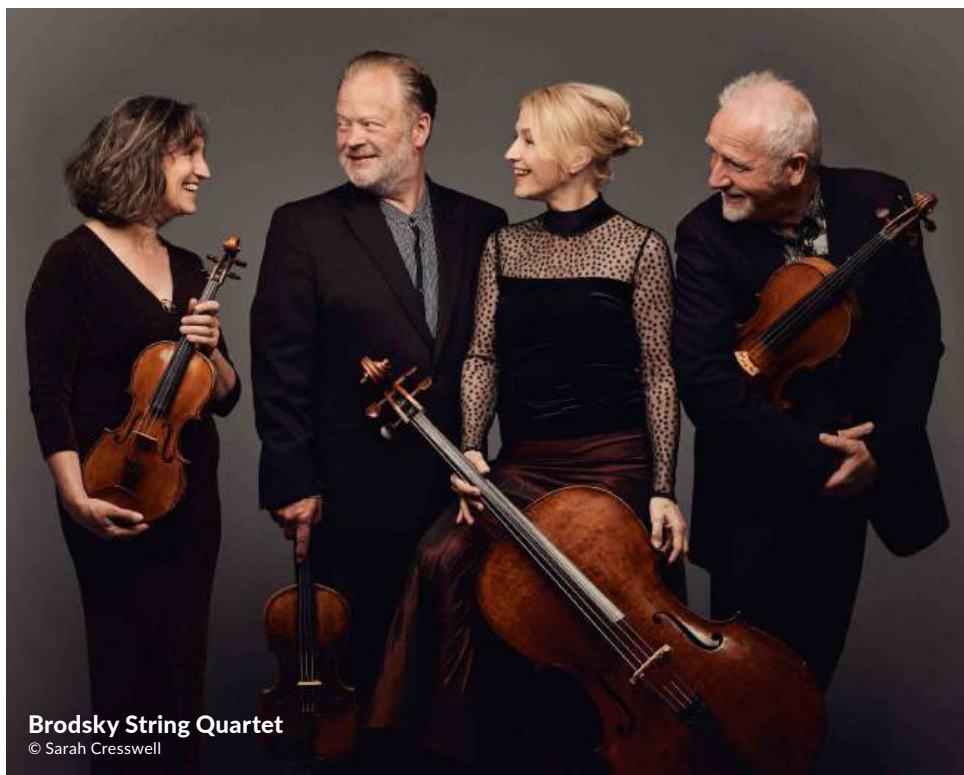
Brodsky String Quartet